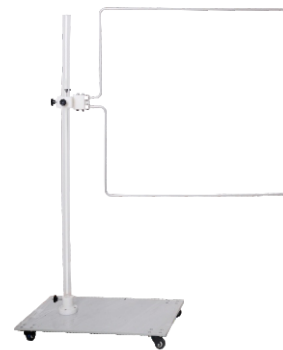
HMFG 100/1000 Field Coils