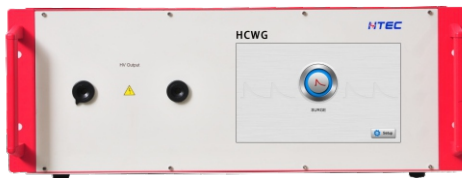
HCWG front view

The HCWG series has excellent and reliable performance, beautiful appearance, fully meets IEC and GB standards, meets pulsed magnetic field (1.2/50 \mu s_8/20 \mu s), and reaches the international first-class level. Equipped with a 1m \times 1m square aluminum tube magnetic field coil, it can achieve a maximum pulse magnetic field strength of 2000A/m. Adopt 7" TFT color touch screen, the operation interface is simple and convenient. Ethernet communication interface for remote microcomputer control).